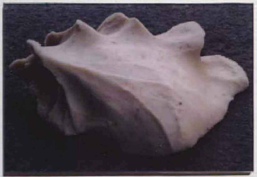
Detail Image: Sandra Calvo Manufactura, 2011 Video and photos